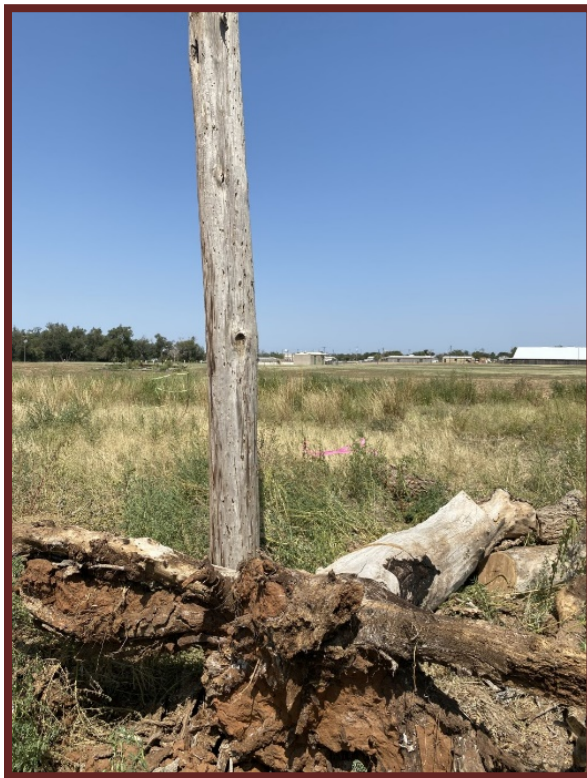
Figure 1: Picture of root plate and tree near the power pole.

On September 3, 2021 TAMFS resources responded to Lamesa, Texas to support the clearing of blow down from a severe thunderstorm. The responding resources included an Incident Commander (ICT5), one FAL2, one FAL3, and two swampers with a chipper. The lead sawyer, the FAL2, worked with the Lamesa Fire Chief (local IC) to survey the area and identify what needed to be cut. During that time, the FAL2 informed the local IC that there were numerous hazard trees that would not be taken due to close proximity to infrastructure such as buildings and utilities. One hazard tree, located near a park, was in close proximity to a power pole and had inactive power lines running through the limbs. The FAL2 decided not to cut the tree that afternoon due to those hazards. Later that evening the local IC had a city utility crew remove the power lines from the tree and power pole.